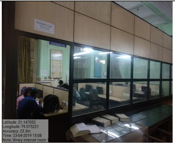
Latitude: 21.147052 Longitude: 79.075221 Accuracy: 23.3m Time: 23-04-2019 15:08 Note: library internet room 1