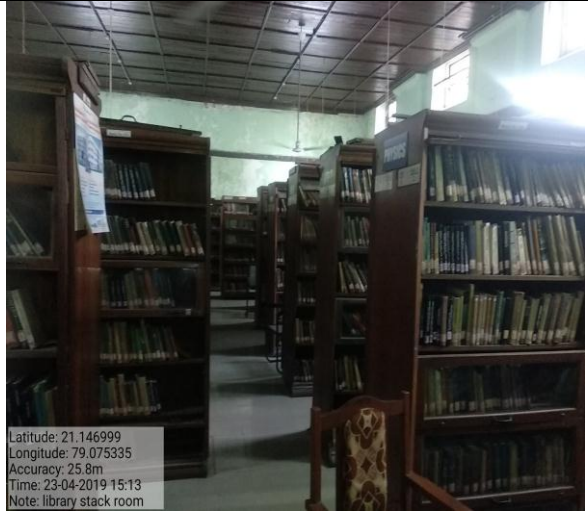
Latitude: 21.146999 Longitude: 79.075335 Accuracy: 25.8m Time: 23-04-2019 15:13 Note: library stack room