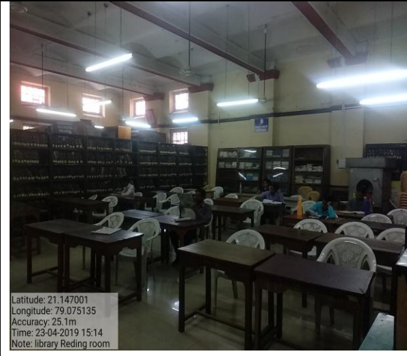
Latitude: 21.147001 Longitude: 79.075135 Accuracy: 25.1m Time: 23-04-2019 15:14 Note: library Reding room