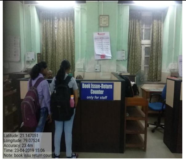
Latitude: 21.147051 Longitude: 79.07524 Accuracy: 23.4m Time: 23-04-2019 15:06 Note: book issu return countid