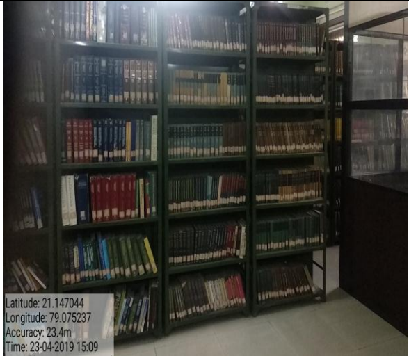
Latitude: 21.147044 Longitude: 79.075237 Accuracy: 23.4m Time: 23-04-2019 15:09