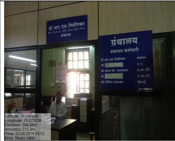
Latitude: 21.147048 Longitude: 79.075238 Elevation: 208.88m Accuracy: 212.3m Time: 23-04-2019 15:12 Note: library cabin