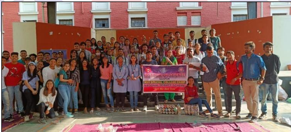
PHOTO DURING THE ECO BRICKS WORKSHOP ATTENDED BY MANY COLLEGES AND NGOs