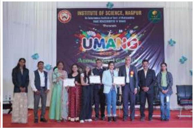
UMANG : Cultural Events