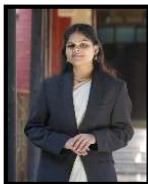
Name of the Committee In-