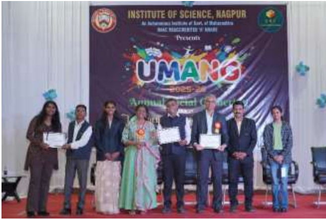
LACF : Open Mic event