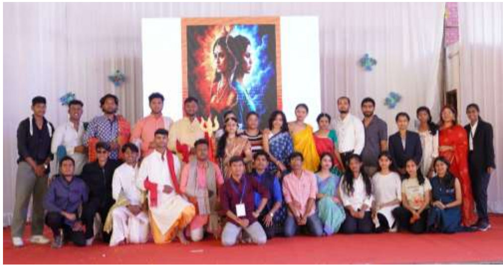
NATRANG DRAMA CLUB TEAM