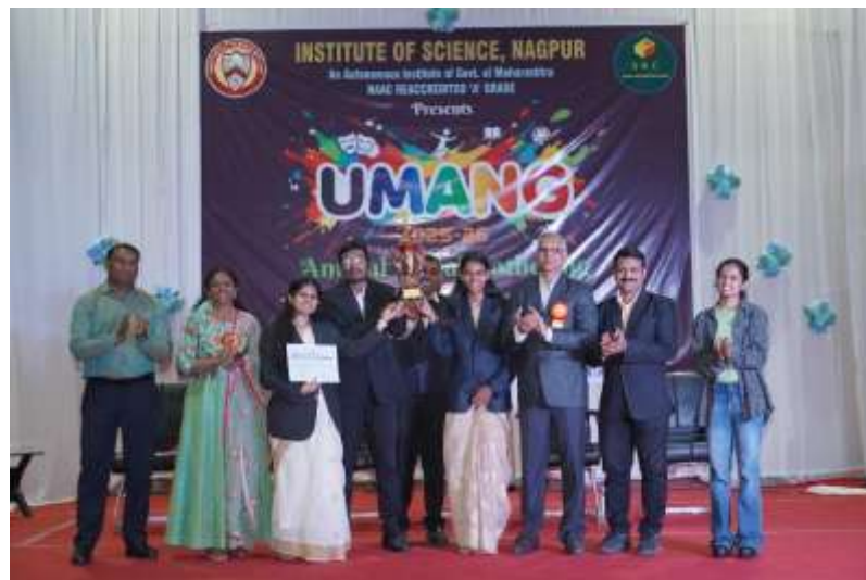
Best Student competition

The final and special prize of the event was the Best Student Award. With this, the Valedictory and Prize Distribution Event came to a successful conclusion, marking the end of UMANG 2K25–26 on a memorable and grand note.