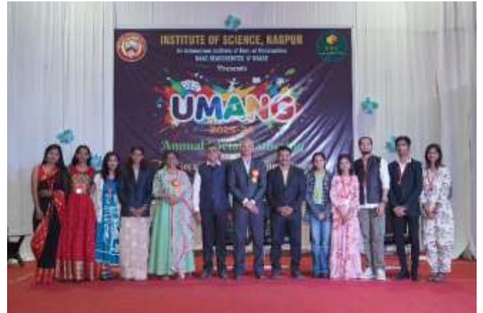
WDC : Kala Mahotsav