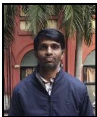
Teacher In-Charge: Charges: